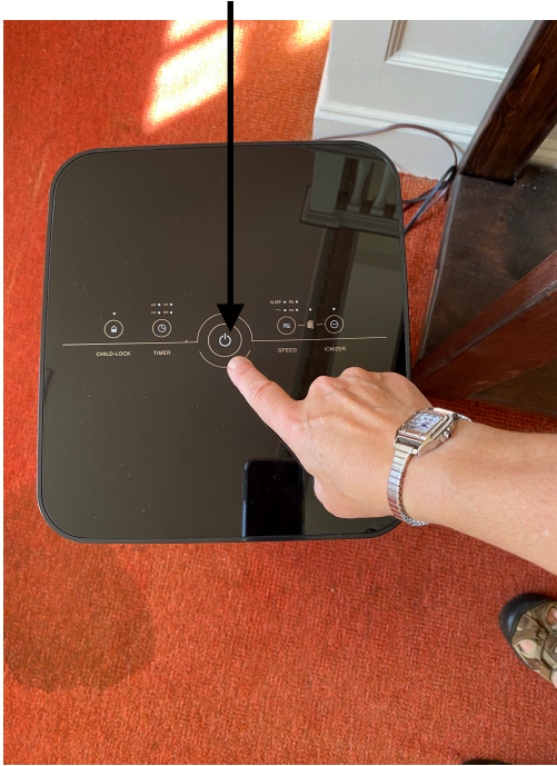
Picture 1. Power button.

2) Set air flow to lowest setting. (Picture 2.)