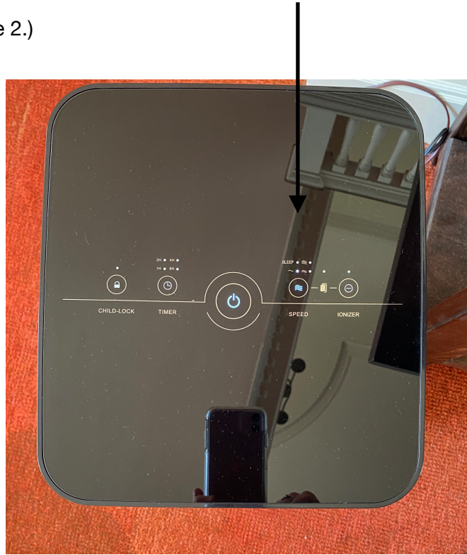
Picture 2. Air flow indicator.